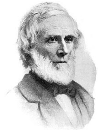
Horace Bushnell.

A blind spot, however, was in the practical and theoretical attitude toward children. Lost little souls, destined for perdition unless converted, constantly in danger of imperiling themselves further, not really among God's elect. Is that all there is to childhood from the perspective of faith? In 1847, Horace Bushnell, a Congregational minister in Detroit, published a revolutionary and controversial little tract, “Christian Nurture”, gradually expanded into a book, outlining a very different perspective on childhood and faith.